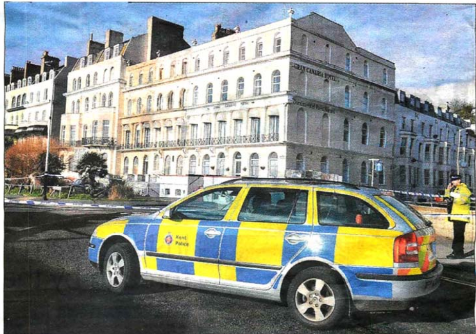
Murder investigation: Dozens of officers have been involved in the case

"I have a 14-year-old son and I'm concerned that if he says one thing that's taken the wrong way then he could get mixed up in it all.